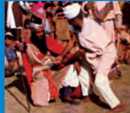
Bandh Pather, Kashmir