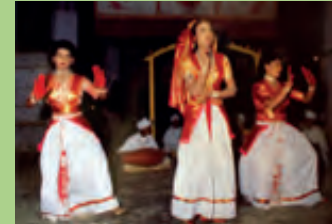
Ankiya Naat, Assam