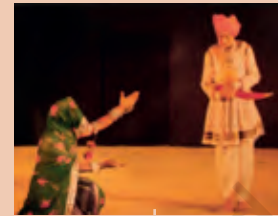
Maach, Madhya Pradesh