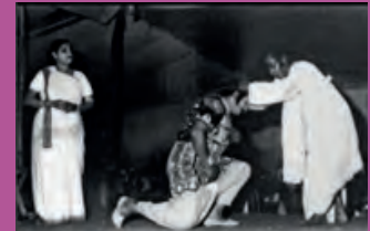
Jaatra, West Bengal