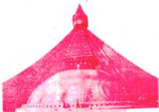
The four-faced stupa, Boudhanath