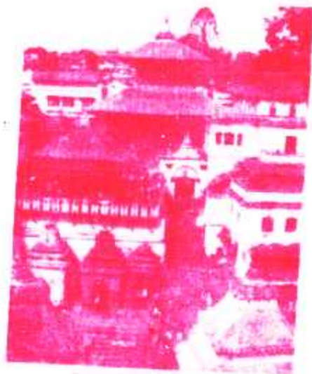
Boudhanath Stupa, Kathmandu

I find it difficult to tear myself away from the square. Flute music always does this to me: