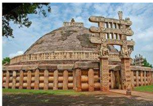
Buddhist Monuments at Sanchi

An important phase of Indian architecture began with the Mauryan period. The material prosperity of the Mauryans and a new religious consciousness led to achievements in all fields. Megasthenes, the Greek ambassador of Selucus Nikator who visited the Mauryan court described Chandragupta Maurya's palace as an excellent architectural achievement. It was a large palace carved out of wood.