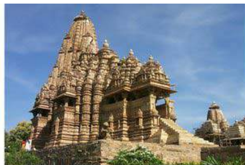
Kandariya Mahadev Temple