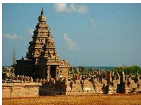
Group of Monuments at Mahabalipuram