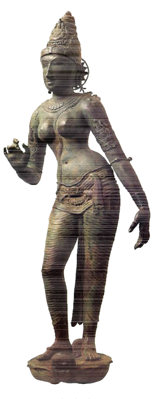
Devi, Chola bronze, Tamil Nadu

is weighed before starting the entire process.) This metal is largely scrap metal from broken pots and pans. While the molten metal is poured in the clay pot, the clay-plastered model is exposed to firing. As the wax inside melts, the metal flows down the channel and takes on the shape of the wax image. The firing process is carried out almost like a religious ritual and all the steps take place in dead silence. The image is later chiselled with files to smoothen it and give it a finish. Casting a bronze image is a painstaking task and demands a high degree of skill. Sometimes an alloy of five metals gold, silver, copper, brass and lead — is used to cast bronze images.