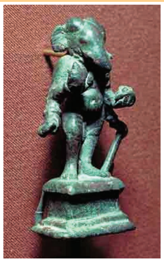
Ganesh, Kashmir, seventh century CE

Andhra Pradesh in the third century CE and at the same time there is a significant change in the draping style of the monk's robe. Buddha's right hand in abhaya mudra is free so that the drapery clings to the right side of the body contour. The result is a continuous flowing line on this side of the figure. At the level of the ankles of the Buddha figure the drapery makes a conspicuous curvilinear turn, as it is held by the left hand.