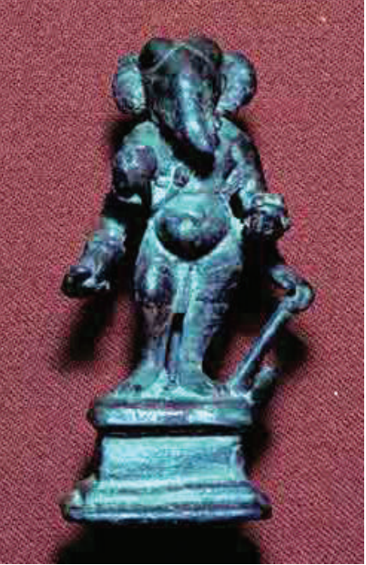
Ganesh, seventh century CE, Kashmir