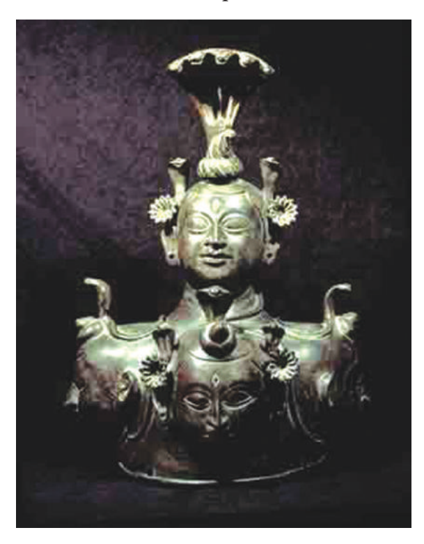
Bronze sculpture, Himachal Pradesh

A noteworthy development is the growth of different types of iconography of Vishnu images. Four-headed Vishnu, also known as Chaturanana or Vaikuntha Vishnu , was worshipped in these regions. While the central face represents Vasudeva,