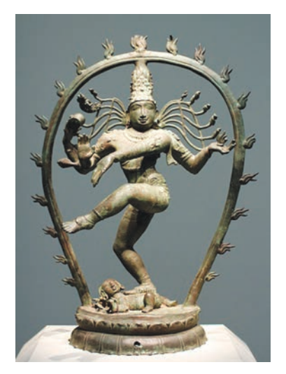
Nataraja, Chola period, twelfth century CE

The bronze casting technique and making of bronze images of traditional icons reached a high stage of development in South India during the medieval period. Although bronze images were modelled and cast during the Pallava Period in the eighth and ninth centuries, some of the most beautiful and exquisite statues were produced during the Chola Period in Tamil Nadu from the tenth to the twelfth century. The technique and art of fashioning bronze images is still skillfully practised in South India, particularly in Kumbakonam. The distinguished patron