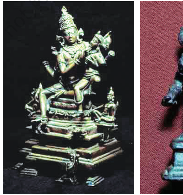
Shiva Family, tenth century CE, Bihar

Many standing Buddha images with right hand in abhaya mudra were cast in North India, particularly Uttar Pradesh and Bihar, during the Gupta and Post-Gupta periods, i.e., between the fifth, sixth and seventh centuries. The sanghati or the monk's robe is wrapped to cover the shoulders which turns over the right arm, while the other