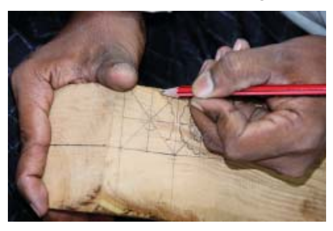
An artisan drawing before carving on wood

Crafts are therefore closely related to concept of form, pattern, design, usage, and these lead to its total aesthetic quality. When all these aspects are rooted in the culture of the people in a particular area of a country or among certain communities, crafts become a