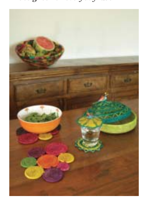
Baskets, mats, coasters designed for everyday use

There are many issues and areas of work involved in this story: child labour, women's work, the skill of basket making, designing new baskets, finding new uses for these baskets, calculating the cost of each basket so that they fetch a fair return without making the basket too expensive, planning a marketing strategy including an exhibition, a catalogue, web marketing, learning about the benefits of a self-help group and the availability of micro credit.