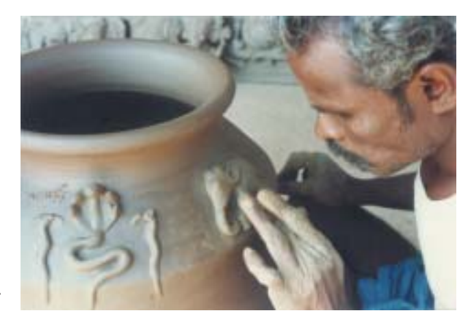
Traditional potter (above) and weaver (below) at work