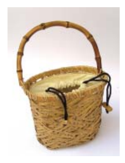
Bamboo basket, Vietnam

Tribal and indigenous arts related to specific cultural traditions of various communities could be termed as people's art as opposed to the more stylised classical arts that evolved within the Hindu social system, or those that