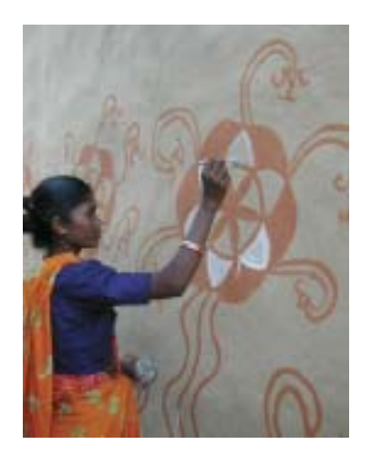
Wall and floor decoration in a house, Jharkhand