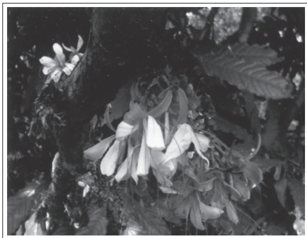
Humboldtia decurrens Bedd — highly rare endemic tree of Southern Western Ghats (India)

There is an urgent need to educate people to adopt environment-friendly practices and reorient their activities in such a way that our development is harmonious with other life forms and is sustainable. There is an increasing consciousness of the fact that such conservation with sustainable use is possible only with the involvement and cooperation of local communities and individuals. For this, the development of institutional structures at local levels is necessary. The critical problem is not merely the conservation of species nor the habitat but the continuation of process of conservation.