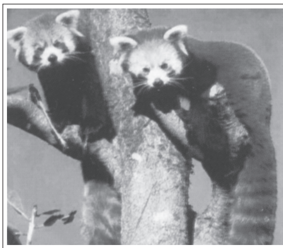
Red Panda — an endangered species

It includes those species which are in danger of extinction. The IUCN publishes information about endangered species world-wide as the Red List of threatened species.