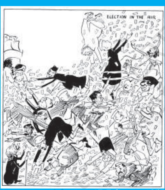
17 February 1957

They say elections are carnival of democracy. But this cartoon depicts chaos instead. Is this true of elections always? Is it good for democracy?