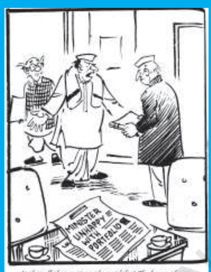
Is that all that masters, the portfolio? The house, the care the servants, travel, the fereign traps, the security, the secretaries, etc., don't they mean acythics to you?

Why do people want to be ministers? This cartoon seems to suggest that it is only for perks and status! Then why is there competition for some portfolios?