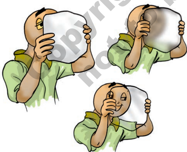
Fig. 4.7 Looking through opaque, transparent or translucent material

You might have played the game of hide and seek. Think of some places where you would like to hide so that you are not seen by others. Why did you choose those places? Would you have tried to hide behind a glass window? Obviously not,