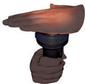
Fig. 4.9 Does torch light pass through your palm?

We can therefore group materials as opaque, transparent and translucent.