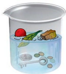
Figure 4.6 Some objects float in water while others sink in it

you let fall into a glass of water. What happens to all of these?