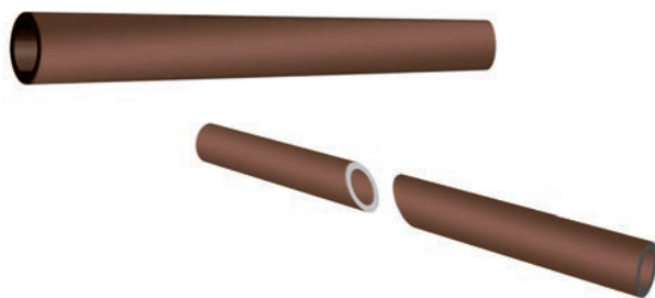
Fig. 4.3 Cutting pieces of materials to see if they have lustre

Do you notice such a shine or lustre in the other materials, cut them anyway as you can? Repeat this in the class with as many materials as possible and make a list of those with and without lustre. Instead of cutting, you can rub the surface of material with sand paper to see if it has lustre.