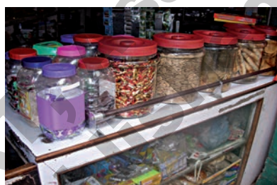
Fig. 4.8 Transparent bottles in a shop

as your friends can see through that and spot you. Can you see through all the materials? Those substances or materials, through which things can be seen, are called transparent (Fig. 4.7). Glass, water, air and some plastics are examples of transparent materials. Shopkeepers usually prefer to keep biscuits, sweets and other eatables in transparent containers of glass or plastic, so that