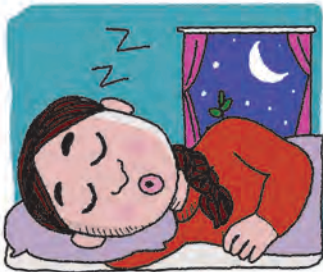
Ruhi is sleeping in the bed.