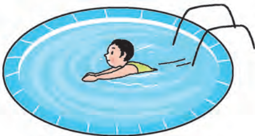
Ali is swimming in the pool.