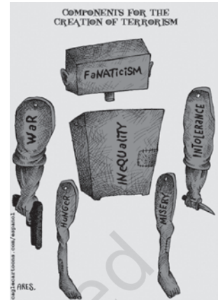
Components for the Creation of Terrorism

List the names of a few Nobel Peace Prize winners. Write a note on any one of them.