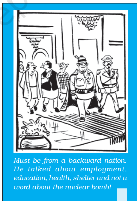
R. K. Laxman in the Times of India

Peace is often defined as the absence of war. The definition is simple but misleading. This is because war is usually equated with armed conflict between countries. However, what happened in Rwanda or Bosnia was not a war of this kind. Yet, it represented a