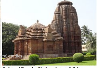
Rajarani Temple, Bhubaneswar, Odisha