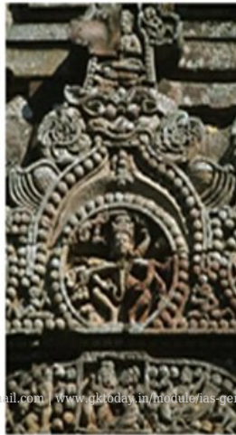
Bho in Shatrughaneshwara Temple