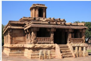
Lad Khan Temple