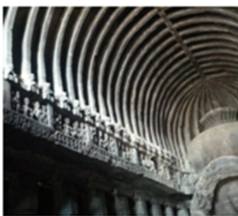
Ribbed Ceilings Vishwakarma Cave, Ellora