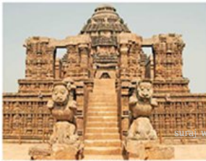
Konark Sun Temple at Front