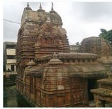
Baitala Deula of Chamunda Bhubaneswar