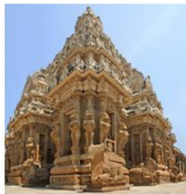
Kailasanathar Temple, Kanchipuram