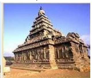
Shore Temple, Mahabalipuram