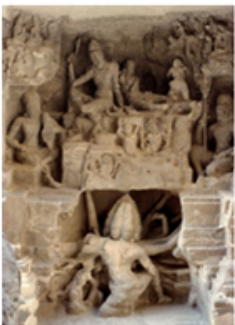
Ravana Shaking Mt. Kailasa Kailashnath Temple, Ellora

The Kailashnath Temple has been carved via the vertical excavation in which the carvers started at the top of the original rock, and excavated downward. The temple has been adorned with pillars, windows, inner and outer rooms, gathering halls, and an enormous stone lingam at its heart. The sculptures include the niches, plasters, windows as well as images of deities, mithunas and other figures. The deities belong to both the Shaivite as well as Vaishnav faith. The grand sculpture of Ravana attempting to lift Mount Kailasa, the abode of Lord Shiva, with his full might is a landmark in Indian art.