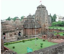
Lingraj Temple, Bhubaneswar