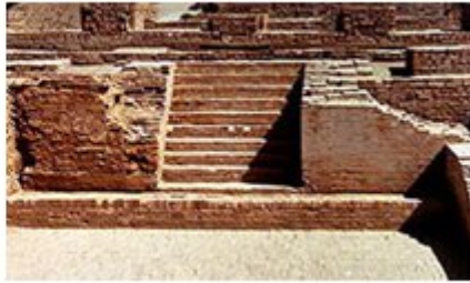
The Great Bath