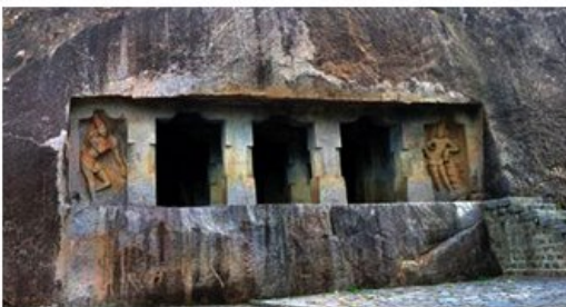
Mandagapattu rock cut temple