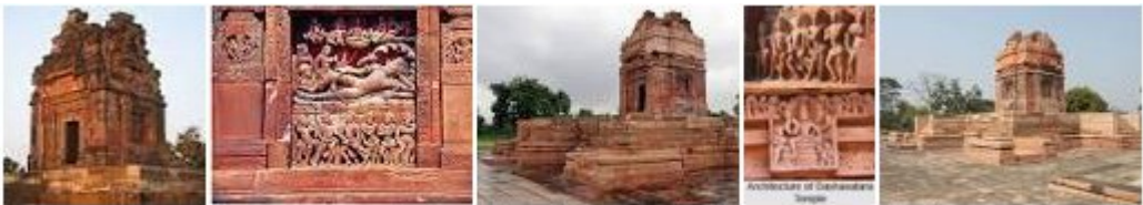
Dasavatara Temple, Deogarh, Uttar Pradesh

The temple depicts the ten avatars of Vishnu. This temple has also been linked to the "Sarvatobhadra temple" mentioned in the Vishnudharmottara Purana by several scholars.