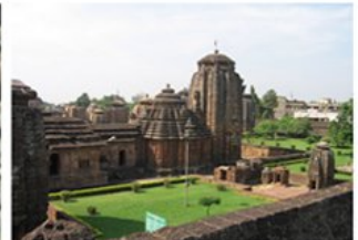
Lingraj Temple, Bhubaneswar