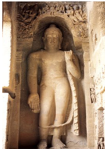
The 22ft Colossal Buddha Kanheri Caves