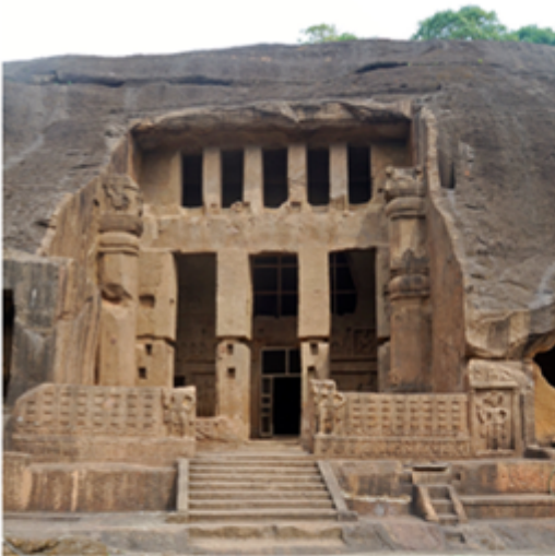
Entrance at a Kanheri Cave

At Kanheri, we find both the Chaityas and Viharas. While creating them, the elements of wooden construction have been retained.