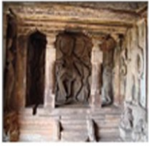
Ravana Phadi Cave