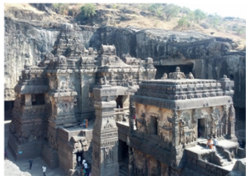
Kailashnath Temple, Ellora