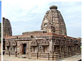
Navbhamra Group of Temples, Alampur