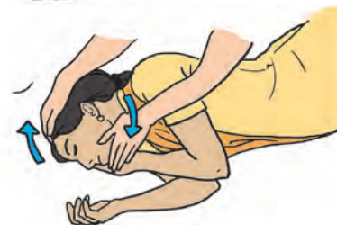
4.10 : First aid for sunstroke