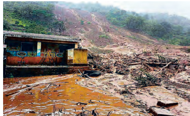
4.4 : The disaster at Malin village