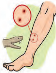
4.11 : First aid for snakebite