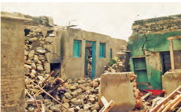
4.2 : Effects of the earthquake at Killari