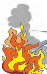
4.7 : Remedial and preventive measures