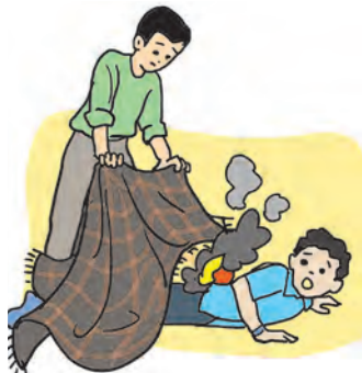
4.9 : Immediate steps for burns