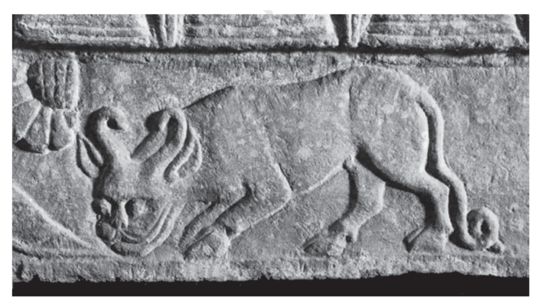
Fig. 4.31 A sculpture in Sanchi

Ans. Buddhist literature help us upto some extent in understanding the sculpture at Sanchi. It is important that the sculptures at Sanchi depict the teachings of Buddha only. The teachings of Buddha are captured in the literature.