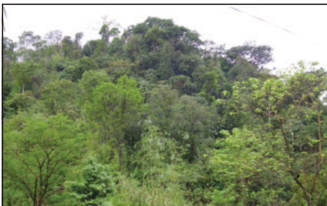
Fig. 6.3: A Tropical Evergreen Forest

Anaconda, one of the world's largest snakes is found in the tropical rainforest. It can kill and eat a large animal such as a crocodile.