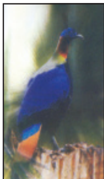
Fig. 6.10: A Monal