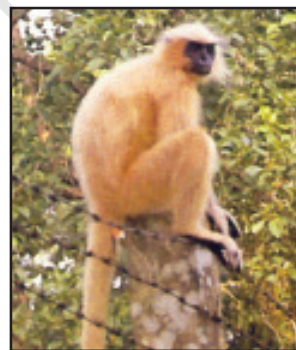
Fig. 6.6: A Golden Langoor