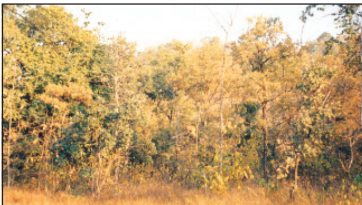
Fig. 6.4: A Tropical Deciduous Forest

Tropical deciduous are the monsoon forests found in the large part of India, northern Australia and in central America (Fig. 6.4). These regions experience seasonal changes. Trees shed their leaves in the dry season to conserve water. The hardwood trees found in these forests are sal, teak, neem and shisham. Hardwood trees are extremely useful for making furniture, transport and constructional materials. Tigers, lions, elephants, langours and monkeys are the common animals of these regions (Fig. 6.5, 6.6 and 6.8).