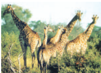
Fig. 6.15: Giraffes