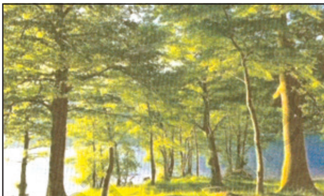
Fig. 6.11: A Temperate Deciduous Forest

As we go towards higher latitudes, there are more temperate deciduous forests (Fig. 6.11). These are found in the north eastern part of USA, China, New Zealand, Chile and also found in the coastal regions of Western Europe. They shed their leaves in the dry season. The common trees are oak, ash, beech, etc. Deer, foxes, wolves are the animals commonly found. Birds like pheasants, monals are also found here (Fig. 6.9 and 6.10).