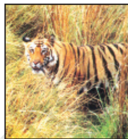
Fig. 6.5: A Tiger