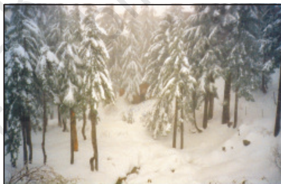
Fig. 6.13 (b): Snow covered Coniferous Forest