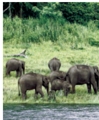
Fig. 6.8: Elephants