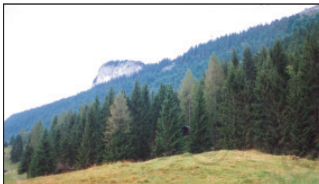
Fig. 6.13 (a): A Coniferous Forest

Taiga means pure or untouched in the Russian language