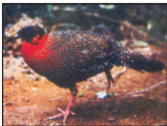
Fig. 6.9: A Pheasant