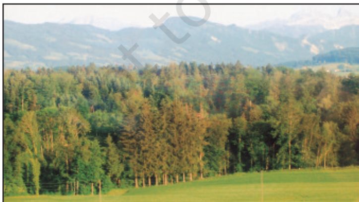
Fig. 6.7: A Temperate Evergreen Forest

The temperate evergreen forests are located in the mid-latitudinal coastal region (Fig. 6.7). They are commonly found along the eastern margin of the continents, e.g., In south east USA, South China and in South East Brazil. They comprise both hard and soft wood trees like oak, pine, eucalyptus, etc.