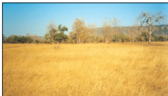
Fig. 6.14: Tropical Grassland

Tropical grasslands: These occur on either side of the equator and extend till the tropics (Fig. 6.14). This vegetation grows in the areas of moderate to low amount of rainfall. The grass can grow very tall, about 3 to 4 metres in height. Savannah grasslands of Africa are of this type. Elephants, zebras, giraffes, deer, leopards are common in tropical grasslands (Fig. 6.15).