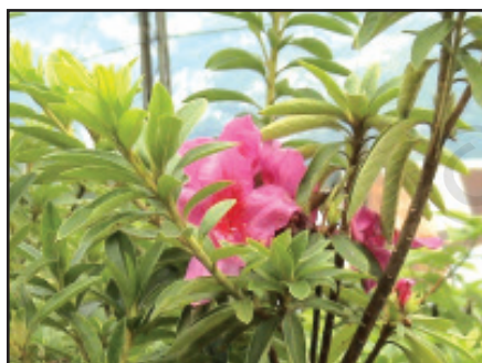
Fig. 6.1: Rhododendron

Salima was excited about the summer camp she was attending. She had gone to visit Manali in Himachal Pradesh along with her class mates. She recalled how surprised she was to see the changes in the landform and natural vegetation as the bus climbed higher and higher. The deep jungles of the foothills comprising sal and teak slowly disappeared. She could see tall trees with thin pointed leaves and cone shaped canopies on the mountain slopes. She learnt that those were coniferous trees. She noticed blooms of bright flowers on tall trees. These were the rhododendrons. From Manali as she was travelling up to Rohtang pass she saw that the land was covered with short grass and snow in some places.