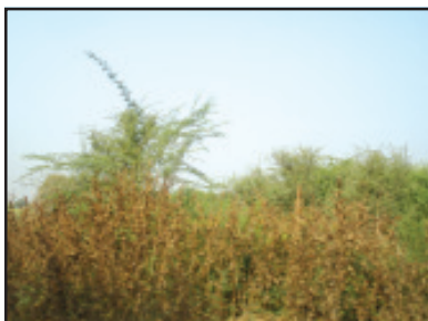
Fig. 6.2: Thorny shrubs