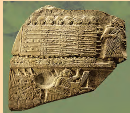
The earliest inscription in the Louvre museum

The above picture shows a fragment of the earliest inscription. A forward marching file of soldiers holding shields and spears is seen here. The General is in the front.