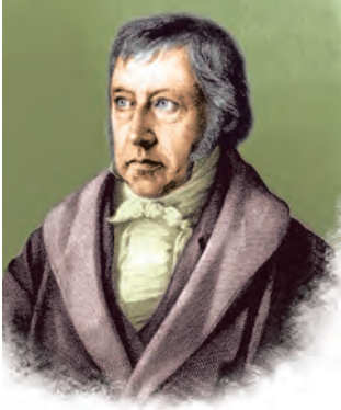
Georg Wilhelm Friedrich Hegel

evidence would come forth. With Hegel's philosophy many scholars were convinced that historical methods were not of lesser quality though they differed from scientific methods. The collection of his lectures and articles is published in a book, entitled 'Encyclopaedia of Philosophical Sciences'. His book, 'Reason in History', is well known.