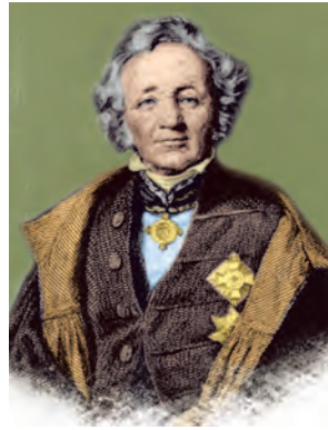
Leopold von Ranké

Historiography of the nineteenth century was greatly influenced by the thoughts of Leopold Von Ranke of Berlin University. He spoke about the critical method of historical research. He put emphasis on the utmost importance of information