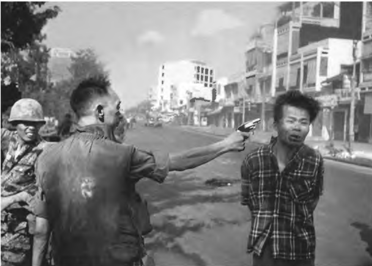
Illustration 8.1 A Vietcong suspect is executed in Saigon by Police Chief Nguyen Ngoc Loan, 1968

further than just economic aid and advisers. In public the Americans said their intervention was to protect the independence of the Vietnamese people, but the real reason was to keep the country securely in the non-communist bloc.