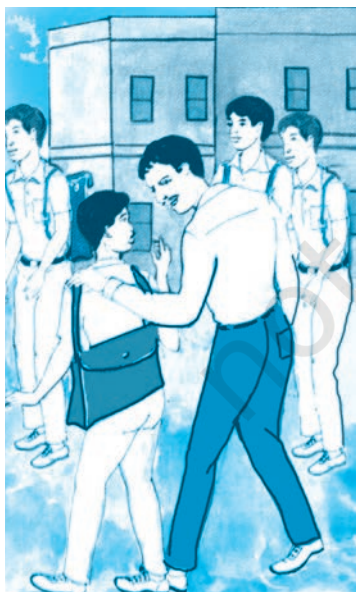
Fig. 2.2 : Parent-child Communication

(a) Teacher (b) Counsellor (c) Classmates (d) Parents (e) All