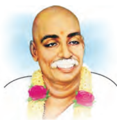
Rashtrasant Tukdoji Maharaj