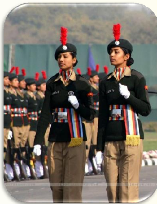
NCC Girl Cadets