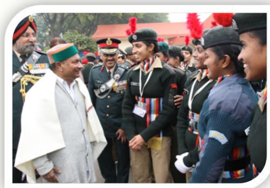
NCC Cadets at the RD Camp