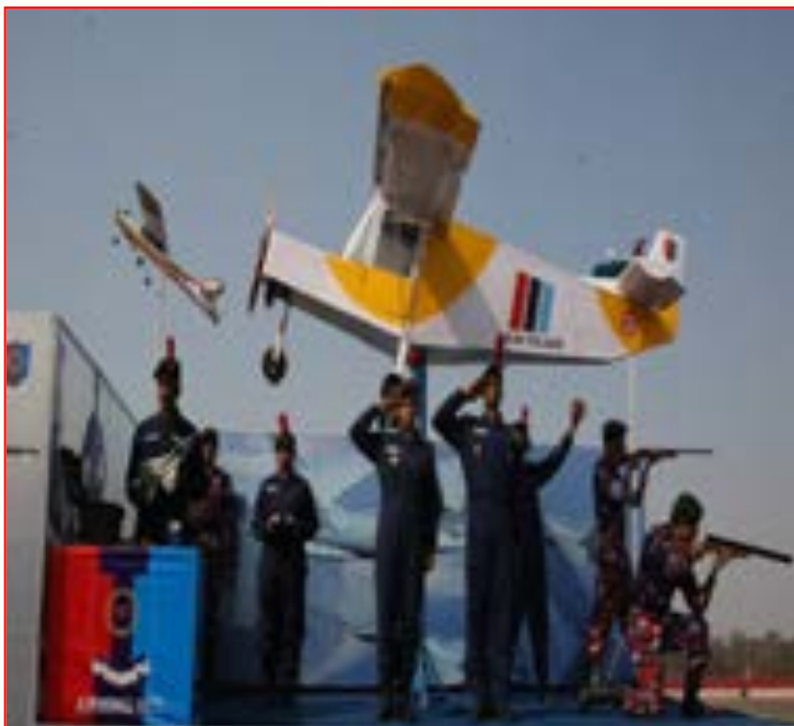
NCC – Airwing

There are two training establishments, namely, Officers Training School, Kamptee and Officers Training School, Gwalior where professors and teachers from colleges and schools are specially trained to impart training to the cadets as Associate NCC Officers (ANOs).