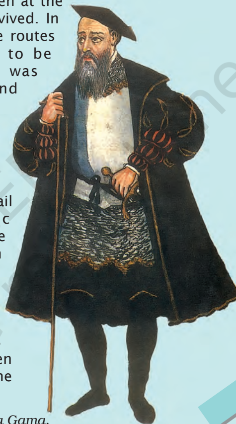
Fig. 9 Vasco da Gama.

The search for sea routes to India had another, unexpected fallout. On the assumption that the earth was round, Christopher Columbus, an Italian, decided to sail westwards across the Atlantic Ocean to find a route to India. He landed in the West Indies (which got their name because of this confusion) in 1492. He was followed by sailors and conquerors from Spain and Portugal, who occupied large parts of Central and South America, often destroying earlier settlements in the area.