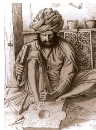
Fig. 3 A wood carver.