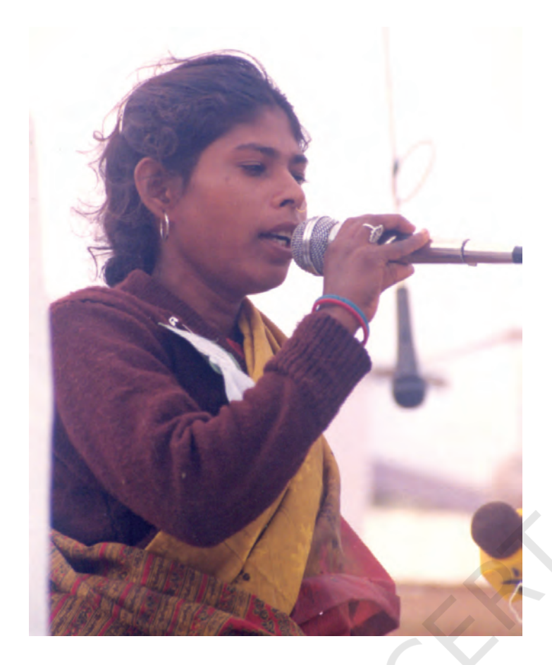
Over 1,500 persons attended a public hearing in Lucknow in 2001 to protest violence against women. Over 15 cases of violence against women were heard by a jury of eminent women who played the role of judges. This people's jury helped highlight the lack of support in the legal system for women who seek justice in such cases.

Issues of equality are central to a democracy. In this book, we have tried to highlight issues that pose a challenge to this idea of equality in a democracy. These, as you have read, include the privatisation of health services in the country, the increasing control that business houses exert on the media, the low value given to women and their work, and the low earnings made by small farmers who grow cotton. These issues substantially affect poor and marginalised communities, and therefore, concern economic and social equality in the country.