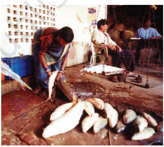
Top: Members of the TMS protesting at a rally. Above: A member of the cooperative weighing the fish.

With the TMS taking over the fishworkers were able to increase their earnings substantially. This was because they set up the cooperative which would buy the catch from them at a fair price. The cooperative would then arrange to transport and sell this in markets where they would get a good price. They have now begun to earn three times more than they earned earlier. The TMS has also begun giving the fishworkers loans for repair and the buying of new nets. By managing to earn a higher wage as well as preserving the fish in the reservoir, the TMS has shown that when people's organisations get their rights to livelihood, they can be good managers.