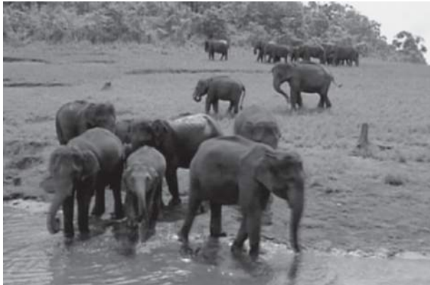
Figure 5.7 : Elephants in their Natural Habitat