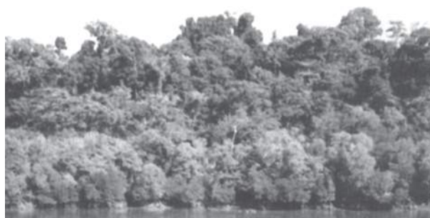
Figure 5.1 : Evergreen Forest

The semi evergreen forests are found in the less rainy parts of these regions. Such forests have a mixture of evergreen and moist deciduous trees. The undergrowing climbers provide an evergreen character to these forests. Main species are white cedar, hollock and kail.