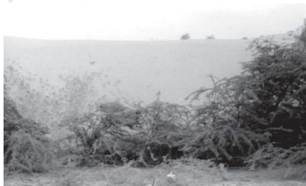
Figure 5.4 : Tropical Thorn Forests

Tropical thorn forests occur in the areas which receive rainfall less than 50 cm. These consist of a variety of grasses and shrubs. It includes semi-arid areas of south west Punjab, Haryana, Rajasthan, Gujarat, Madhya Pradesh and Uttar Pradesh. In these forests, plants remain leafless for most part of the year and give an expression of scrub vegetation. Important species found are babool, ber , and wild date palm, khair, neem, khejri, palas , etc. Tussocky grass grows upto a height of 2 m as the under growth.