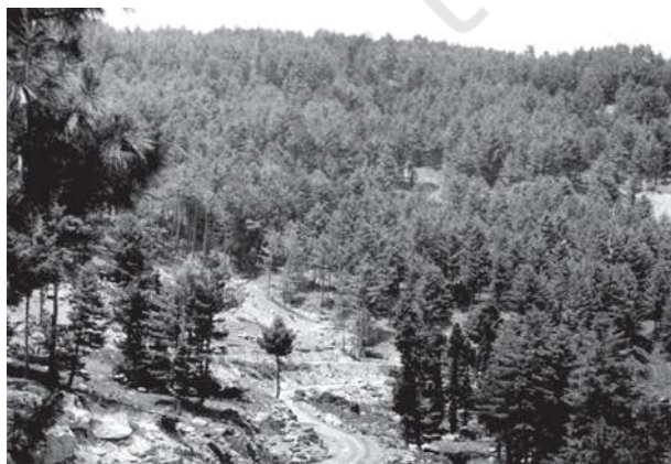
Figure 5.5 : Montane Forests

The Himalayan ranges show a succession of vegetation from the tropical to the tundra, which change in with the altitude. Deciduous forests are found in the foothills of the Himalayas. It is succeeded by the wet temperate type of forests between an altitude of 1,000-2,000 m. In the higher hill ranges of northeastern India, hilly areas of West Bengal and Uttaranchal, evergreen broad leaf trees such as oak and chestnut are predominant. Between 1,500-1,750 m, pine forests are also well-developed in this zone, with Chir Pine as a very useful commercial tree. Deodar, a highly valued endemic species grows mainly in the western part of the Himalayan range. Deodar is a durable wood mainly used in construction activity. Similarly, the chinar and the walnut, which sustain the famous Kashmir handicrafts, belong to this zone. Blue pine and spruce appear at altitudes of 2,225-3,048 m. At many places in this zone, temperate grasslands are also found. But in the higher reaches there is a transition to Alpine forests and pastures. Silver firs, junipers, pines, birch and rhododendrons, etc. occur between 3,000-4,000 m. However, these pastures are used extensively for transhumance by tribes like the Gujjars, the Bakarwals, the Bhotiyas and the Gaddis. The southern slopes of the Himalayas carry a thicker vegetation cover because of relatively higher precipitation than the drier north-facing slopes. At higher altitudes, mosses and lichens form part of the tundra vegetation.