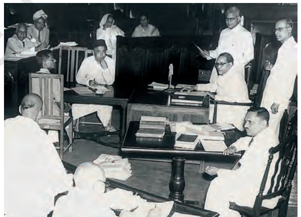
Dr. B.R. Ambedkar presiding over a discussion in the Constituent Assembly

Dr. B.R. Ambedkar CAD, Vol. VII, p.37, 4 November 1948