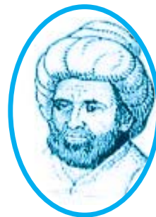
Muhammad ibn Musa al-Khwarizmi (A.D. 780 – 850)

A lemma is a proven statement used for proving another statement.