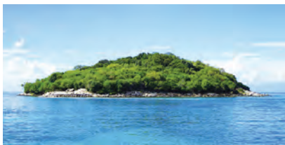
(a) marooned on an island