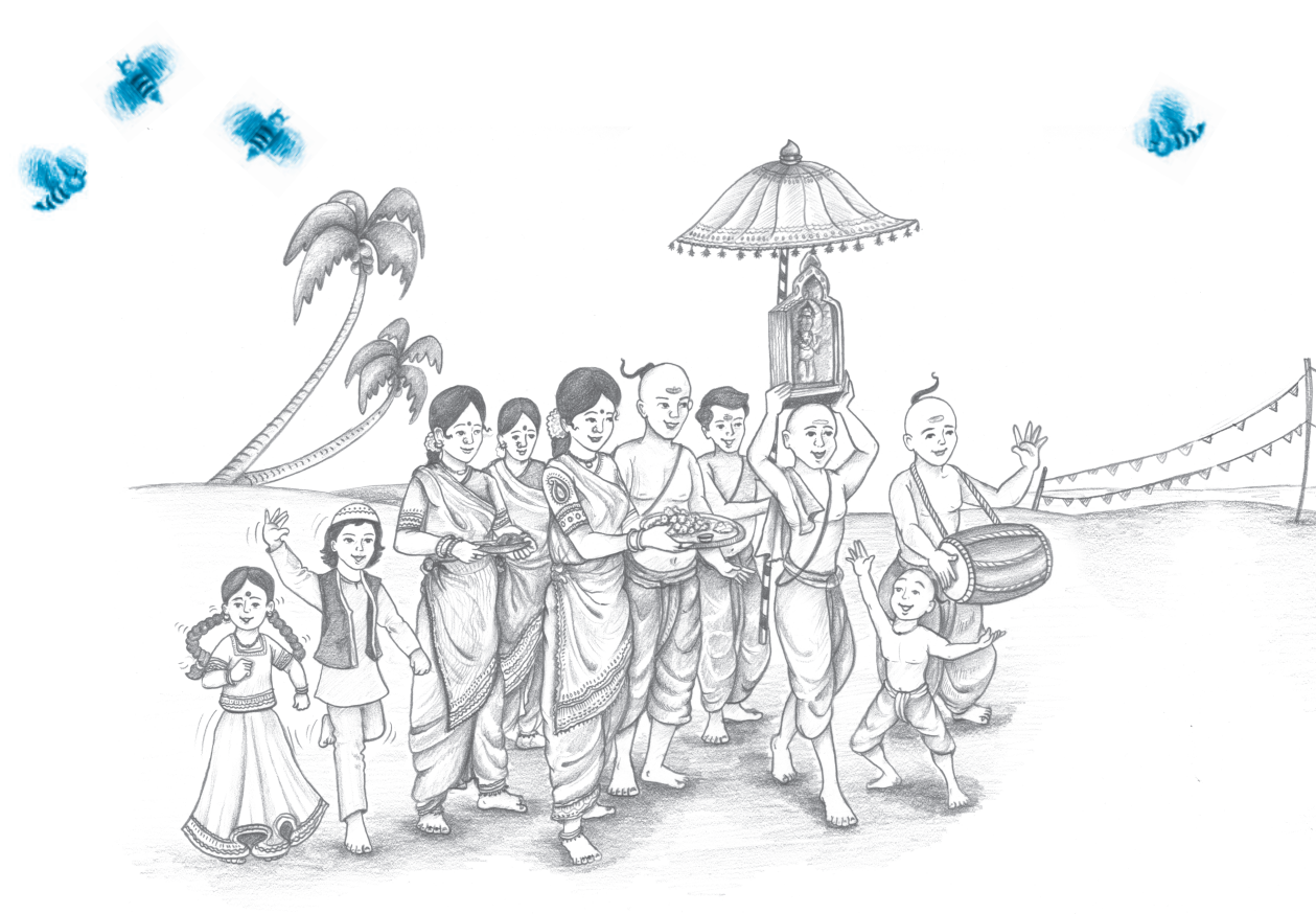
Our family used to arrange boats for carrying idols of the Lord from the temple to the marriage site.

father; Aravindan went into the business of arranging transport for visiting pilgrims; and Sivaprakasan became a catering contractor for the Southern Railways.