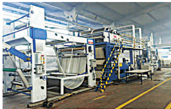
Picture No. 7.3 Sanforizing Machine

The fibres are made to assume a final condition by shrinking the fabric in a preparatory finishing process that minimize subsequent shrinkage, such as immersions in cold water, followed by hot water, steam or a chemical treatment.