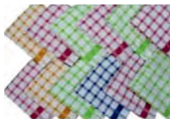
Picture No. 7.9 Fabrics with Mildew proof finish