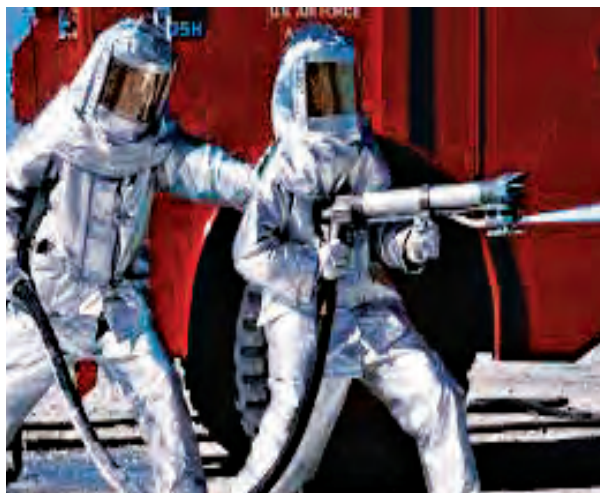
Picture No. 7.6 Fire-proof Fabrics

Find out detailed information about textile items which needs fireproof finish in defence organization.