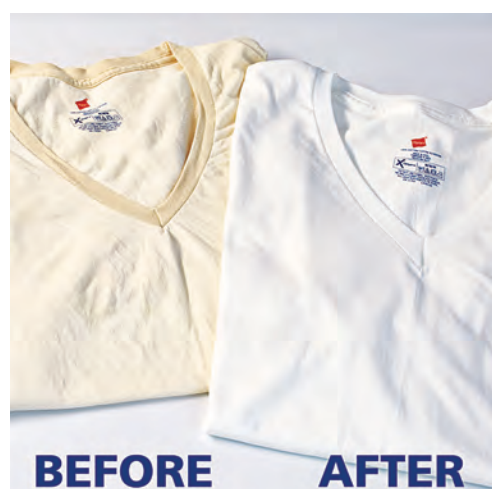
Picture No. 7.2 Effect of Bleaching

Manmade fibers sometimes require bleaching but if they are properly processed during manufacture, many fibers are naturally white.