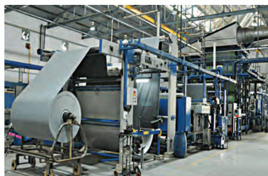
Picture No. 7.4 Calendaring Machine

Calendering is the finish applied to nearly all the fabrics. Technically, the word pressing is used for wool fabrics and calendering is used for all the other fibre fabrics.