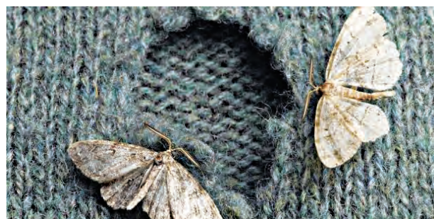
Picture No. 7.8 - Attack on Cloth by Moth