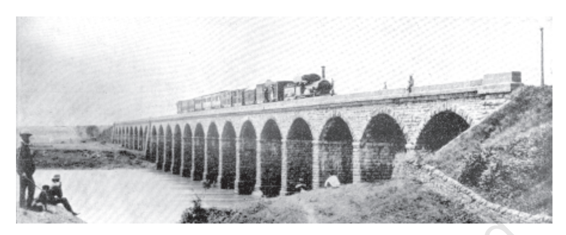
Fig. 1.4 First Railway Bridge linking Bombay with Thane, 1854

Indian people gained owing to the introduction of the railways, were thus outweighed by the country's huge economic loss.