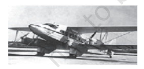
Fig.1.5 Tata Airlines, a division of Tata and Sons, was established in 1932 inaugurating the aviation sector in India

Along with the development of roads and railways, the colonial dispensation also took measures for developing the inland trade and sea lanes. However, these measures were far from satisfactory. The inland waterways, at times, also proved uneconomical as in the case of the Coast Canal on the Orissa coast. Though the canal was built at a huge