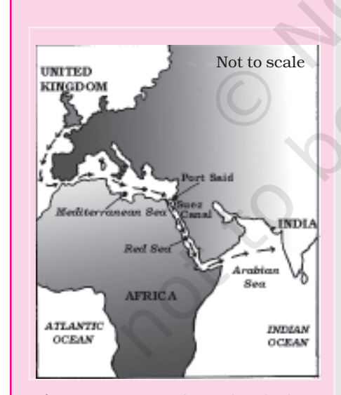
Fig.1.2 Suez Canal: Used as highway between India and Britain

Various details about the population of British India were first collected through a census in 1881. Though suffering from certain limitations, it revealed the unevenness in India's population growth. Subsequently,