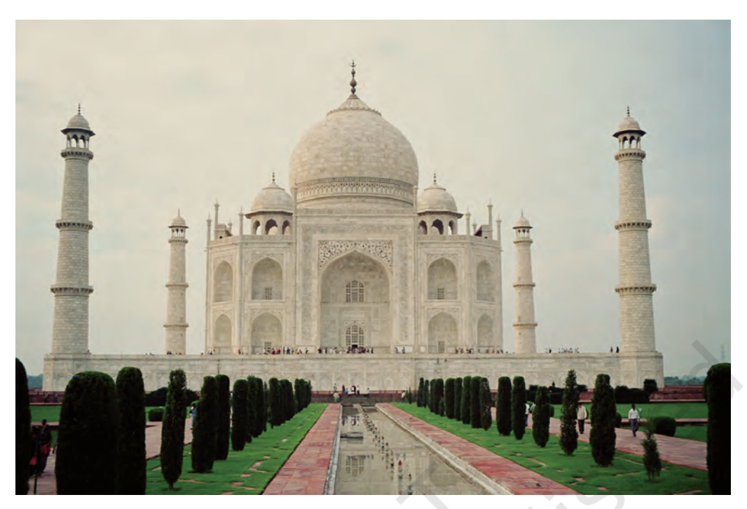
Fig. 18.4: Taj Mahal

ordered industries to switch to cleaner fuels like CNG (Compressed Natural Gas) and LPG (Liquefied Petroleum Gas). Moreover, the automobiles should switch over to unleaded petrol in the Taj zone.