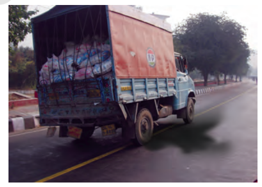
Fig. 18.3: Air pollution due to automobiles

Vehicles produce high levels of pollutants like carbon monoxide, carbon dioxide, nitrogen oxides and smoke (Fig. 18.3). Carbon monoxide is produced from incomplete burning of fuels such as petrol and diesel. It is a poisonous gas. It reduces the oxygen-carrying capacity of the blood.