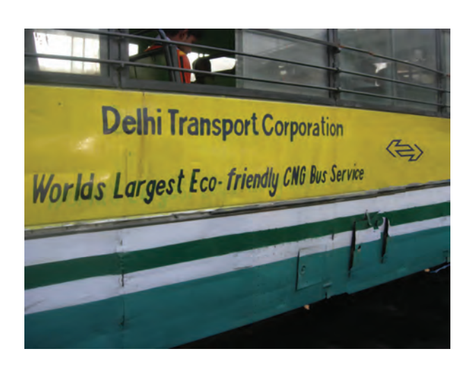
Fig. 18.5: A public transport bus powered by CNG

There are many success stories in our fight against air pollution. For example, a few years ago, Delhi was one of the most polluted cities in the world. It was being choked by fumes released from automobiles running on diesel and petrol. A decision was taken to switch to fuels like CNG (Fig. 18.5) and