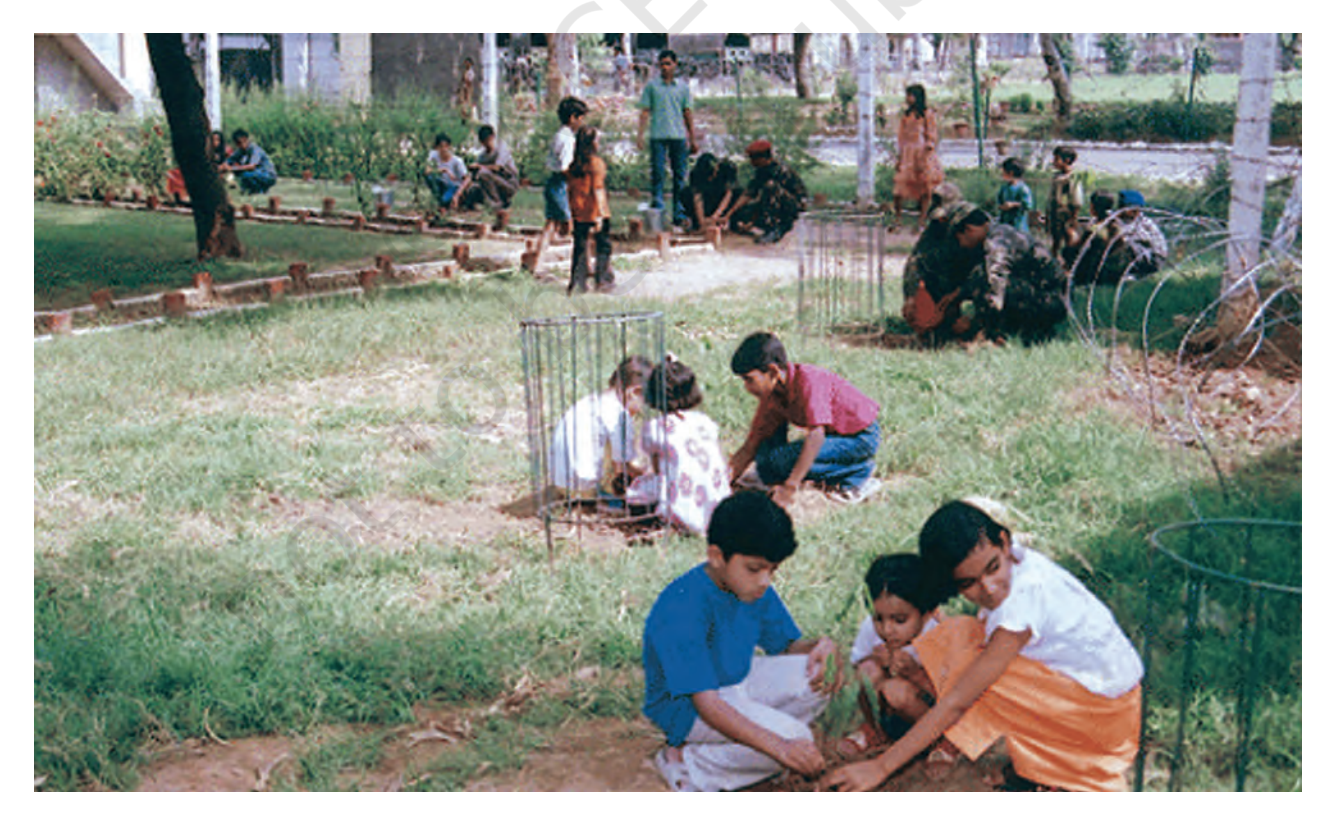
Fig. 18.6: Children planting saplings

Small contributions on our part can make a huge difference in the state of the environment. We can plant trees and nurture the ones already present in the neighbourhood. Do you know about Van Mahotsav , when lakhs of trees are planted in July every year (Fig. 18.6)?