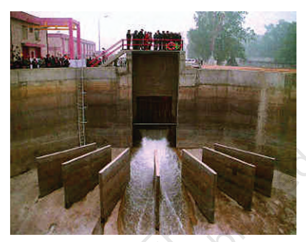
Fig. 18.10: Water treatment plant

water used for washing vegetables may be used to water plants in the garden.