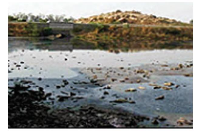
Fig. 18.9 : Industrial waste discharged into a river

Many industries discharge harmful chemicals into rivers and streams, causing the pollution of water (Fig. 18.9). Examples are oil refineries, paper factories, textile and sugar mills