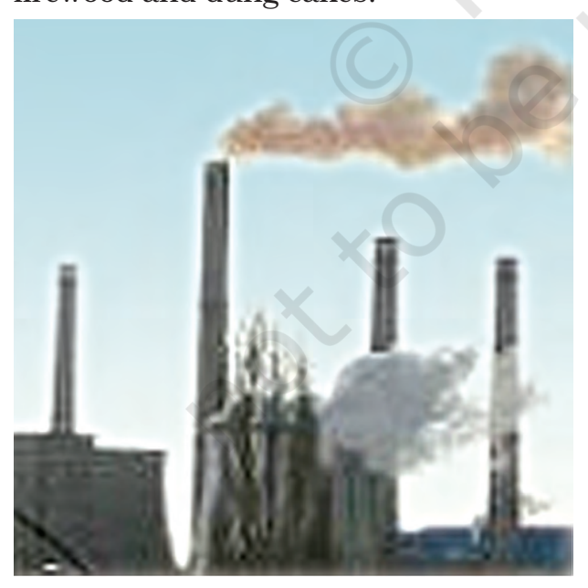
Fig. 18.2: Smoke from a factory

The substances which contaminate the air are called air pollutants . Sometimes, such substances may come from natural sources like smoke and dust arising from forest fires or volcanic eruptions. Pollutants are also added to the atmosphere by certain human activities. The sources of air pollutants are factories (Fig. 18.2), power plants, automobile exhausts and burning of firewood and dung cakes.