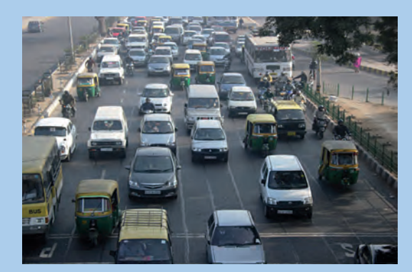
Fig. 18.1: A congested road in a city