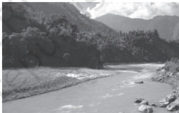
Figure 3.1 : A River in the Mountainous Region

2006) in this class . Can you, then, explain the reason for water flowing from one direction to the other? Why do the rivers originating from the Himalayas in the northern India and the Western Ghat in the southern India flow towards the east and discharge their waters in the Bay of Bengal?