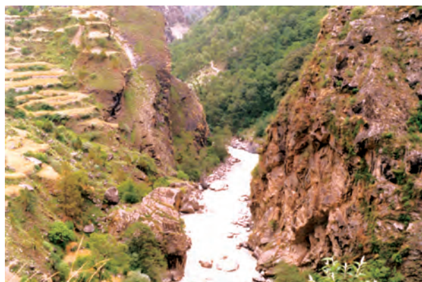
Figure 3.2 : A Gorge

Apart from originating from the two major physiographic regions of India, the Himalayan and the Peninsular rivers are different from each other in many ways. Most of the Himalayan rivers are perennial . It means that they have water throughout the year. These rivers receive water from rain as well as from melted snow from the lofty mountains. The two major Himalayan rivers, the Indus and the Brahmaputra originate from the north of the mountain ranges. They have cut through the mountains making gorges. The Himalayan rivers have long courses from their source to the sea.