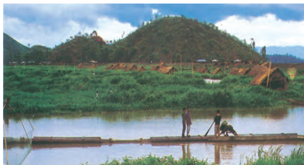
Figure 3.6 : Loktak Lake

Most of the freshwater lakes are in the Himalayan region. They are of glacial origin. In other words, they formed when glaciers dug out a basin, which was later filled with snowmelt. The Wular lake in Jammu and Kashmir, in contrast, is the result of tectonic activity. It is the largest freshwater lake in India. The Dal lake, Bhimtal, Nainital, Loktak and Barapani are some other important freshwater lakes.