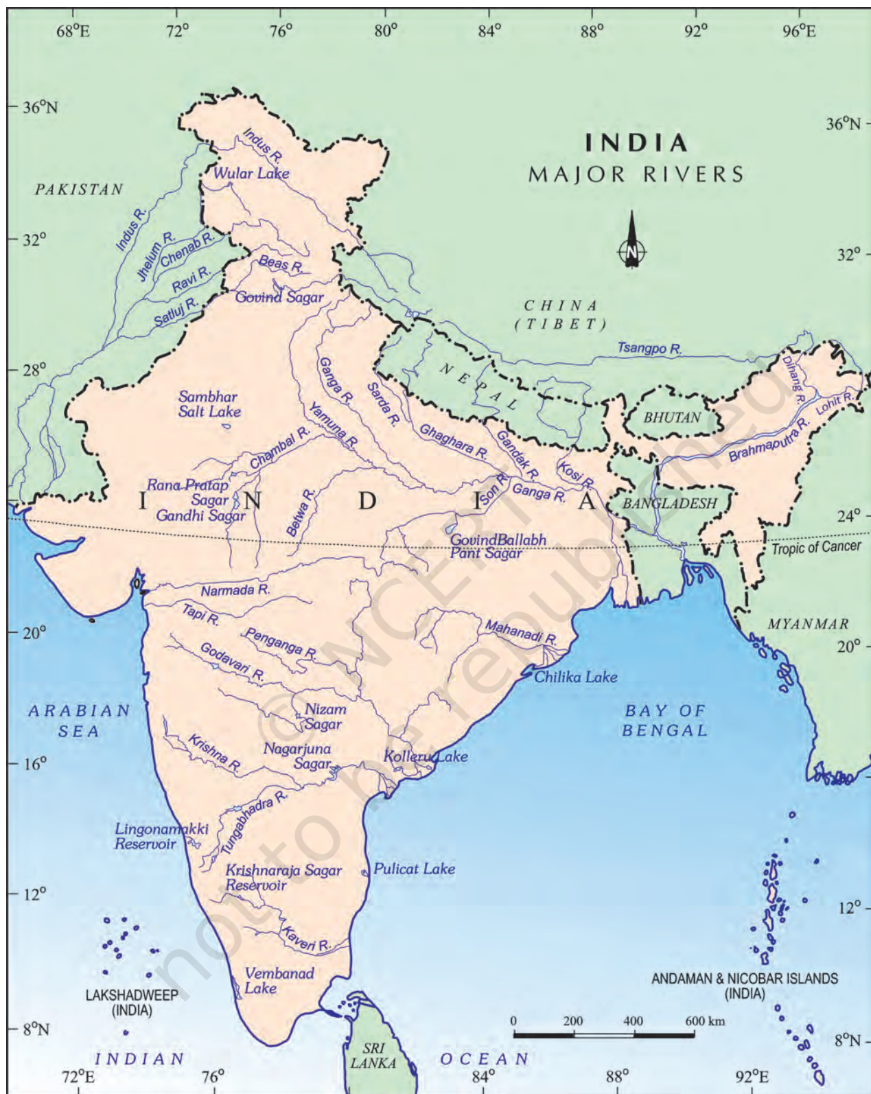
Figure 3.4 : Major Rivers and Lakes