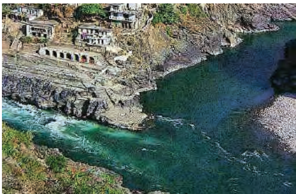
Figure 3.5 : Confluence of Bhagirathi and Alaknanda at Devaprayag

The Ganga is joined by many tributaries from the Himalayas, a few of them being major rivers, such as the Yamuna, the Ghaghara, the Gandak and the Kosi. The river Yamuna rises from the Yamunotri Glacier in the Himalayas. It flows parallel to the Ganga and as a right bank tributary meets the Ganga at Allahabad. The Ghaghara, the Gandak and the Kosi rise in the Nepal Himalaya. They are the rivers, which flood parts of the northern plains every year, causing widespread damage to life and property, whereas, they enrich the soil for agricultural use.