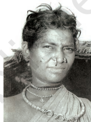
Fig. 5 A Gond woman.

The administrative system of these kingdoms was becoming centralised. The kingdom was divided into