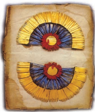
Fig. 7 Ear ornaments, Kobo Naga tribe, Manipur.