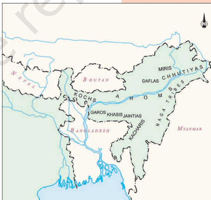
Map 3 Tribes of eastern India.

Discuss why the Mughals were interested in the land of the Gonds.