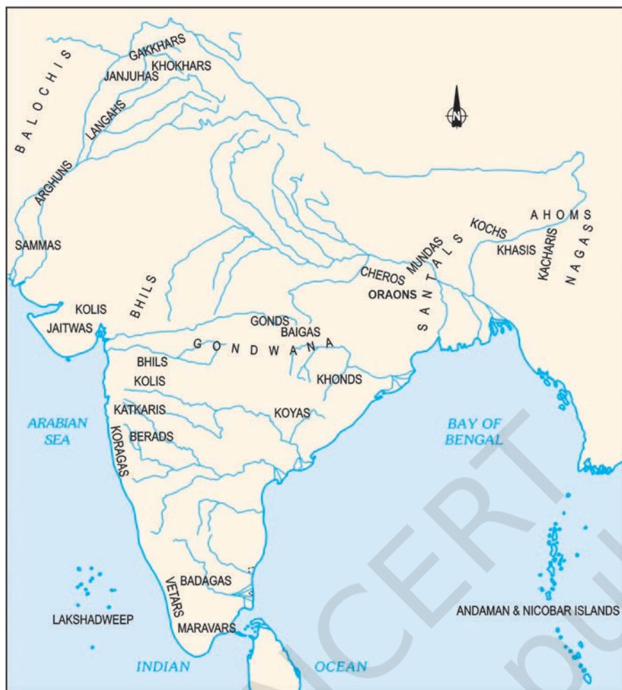
Map 1 Location of some of the major Indian tribes.

tribe in the north-west. They were divided into many smaller clans under different chiefs. In the western Himalaya lived the shepherd tribe of Gaddis. The distant north-eastern part of the subcontinent too was entirely dominated by tribes – the Nagas, Ahoms and many others.