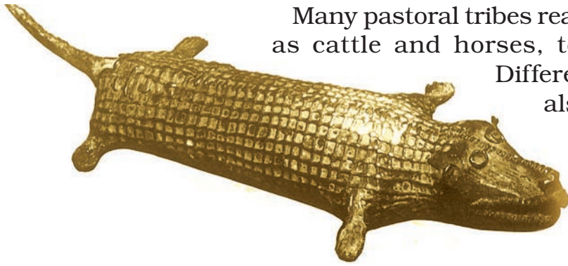
Fig. 4 Bronze crocodile, Kutiya Kond tribe, Orissa.

Many pastoral tribes reared and sold animals, such as cattle and horses, to the prosperous people.