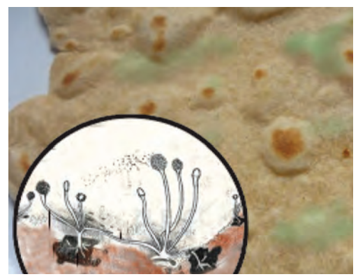
Fungus as seen through a microscope

The cottonwool-like fibrous growth on the chapati is a kind of fungus. A fungus is a type of micro-organism.