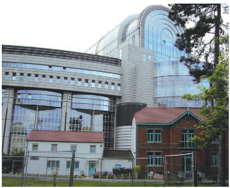
European Parliament in Brussels, Belgium

You might find the Belgian model very complicated. It indeed is very complicated, even for people living in Belgium. But these arrangements have worked well so far. They helped to avoid civic strife between the two major communities and a possible division of the country on linguistic lines. When many countries of Europe came together to form the European