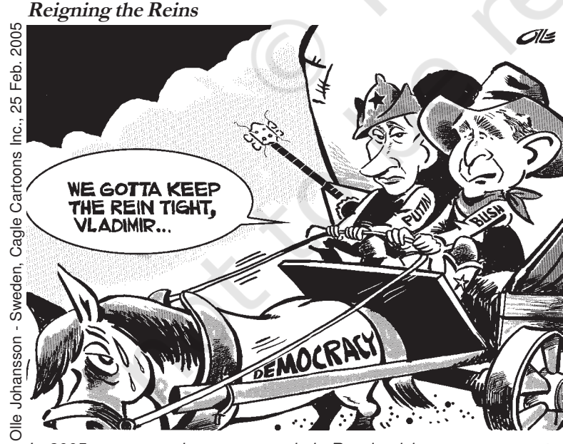
In 2005, some new laws were made in Russia giving more powers to its president. During the same time the US president visited Russia. What, according to this cartoon, is the relationship between democracy and concentration of power? Can you think of some other examples to illustrate the point being made here?

2 Power can be shared among governments at different levels – a general government for the entire country and governments at the provincial or regional level. Such a general government for the entire country is usually called federal government. In India, we refer to it as the Central or Union Government. The governments at the provincial or regional level are called by different names in different countries. In India,