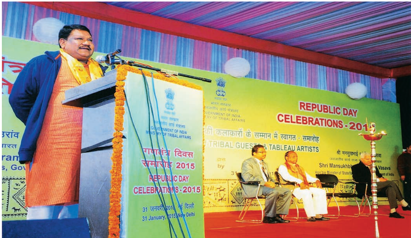
Hon'ble Minister of Tribal Affairs speaking on the occasion of Reception on 31.01.2015 for Tribal Guests and Tableau Artists during the "Republic Day 2015 Celebrations"

2015. The tribal guests also called on the President of India, Vice-President and Prime Minister. They also met Defence Minister. The tribal guests paid homage to the Father of the Nation at Rajghat on 30th January, 2015. The Hon'ble Minister of Tribal Affairs and Minister of State for Tribal Affairs hosted a reception on 31.01.2015 in the honour of tribal guests and awarded gifts to the guests.