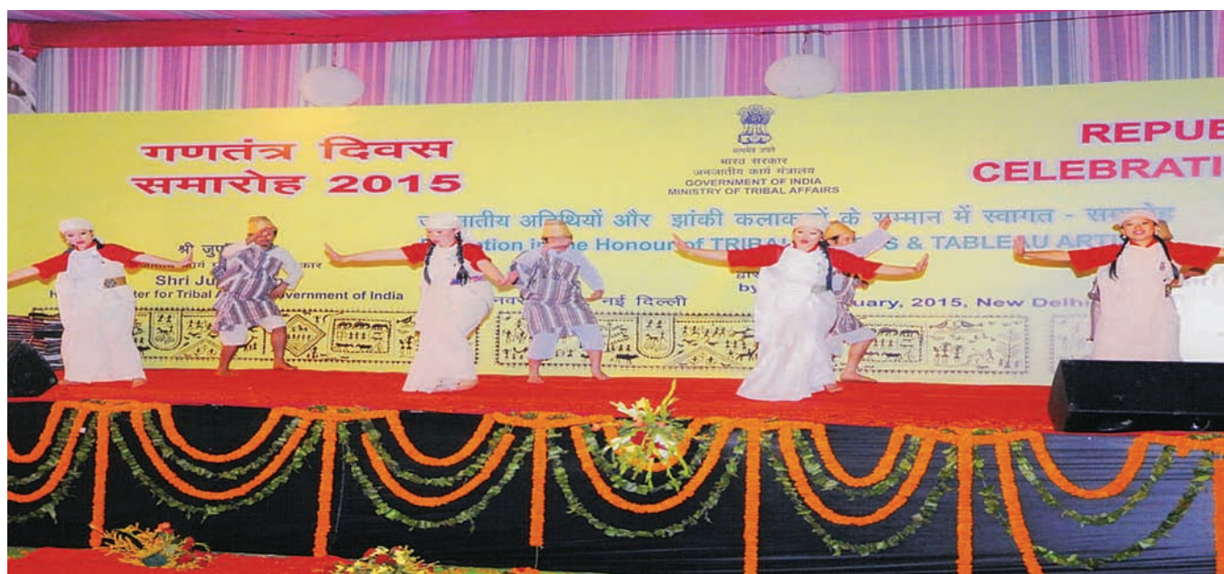
Cultural performance at Reception held by Hon'ble Minister of Tribal Affairs on 31.01.2015 for Tribal Guests /Tableau Artists during the "Republic Day 2015 Celebrations"

1.31 The scheme-wise Budget Estimates, Revised Estimates and expenditure during 2012-13, 2013-14 and 2014-15 is at Annex:1-B (i) and 1-B (ii)