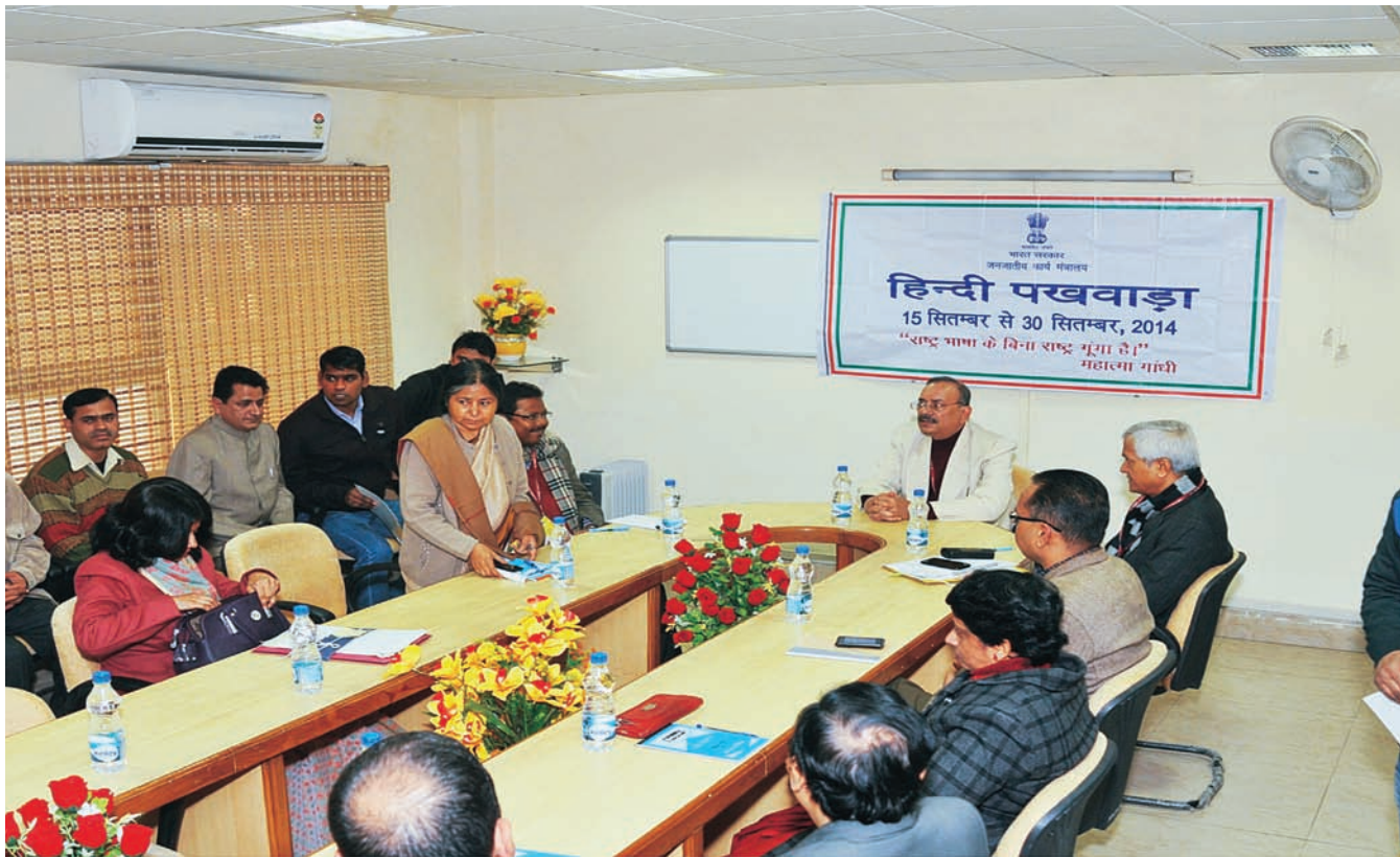
Secretary, Ministry of Tribal Affairs, Chairing a meeting on the occasion of Hindi Fortnight (15th September to 30th September 2014).