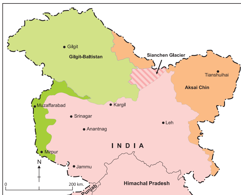
Jammu and Kashmir and Ladakh