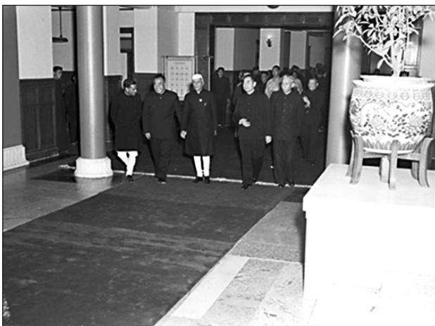
Pandit Jawaharlal Nehru at the banquet hall with Premier Chou EnLai, 1954.

India's primary security concern has been Pakistan and China. India has disputed borders with both Pakistan and China. India has also expressed concern about the close strategic relations between China and Pakistan. China has provided assistance to Pakistan for its nuclear weapon and missile programmes. Increasing Chinese presence in Pakistan Occupied Kashmir, especially in the Gilgit-Baltistan region is a matter of concern to India. The China-Pakistan-Economic Corridor is part of this Chinese presence.