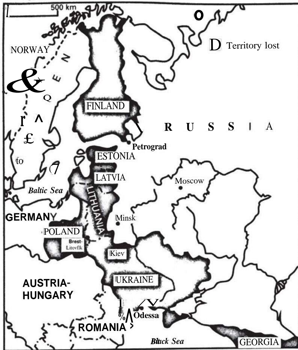
Map 16.1 Russian losses by the Treaty of Brest-Litovsk

half her heavy industry (Map 16.1). This was a high price to pay, and all the other parties condemned it; the Left Socialist Revolutionaries walked out of Sovnarkom. However, Lenin insisted that it was worth it, pointing out that Russia needed to sacrifice space in order to gain time to recover. He probably expected Russia to get the land back anyway when, as he hoped, the revolution spread to Germany and other countries.