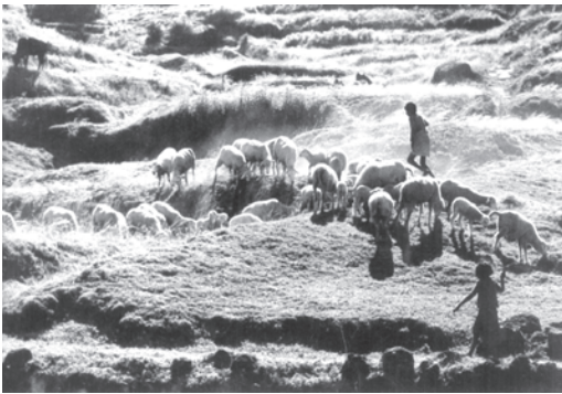
Fig. 6.3 Sheep rearing — an important income augmenting activity in rural areas

followed by others. Other animals which include camels, asses, horses, ponies and mules are in the lowest rung. India had about 300 million cattle, including 108 million buffaloes, in 2012. Performance of the Indian dairy sector over the last three decades has been quite impressive. Milk production in the country has increased by more than eight times between 1951-2014. This can be attributed mainly to the successful implementation of 'Operation Flood'. It is a system whereby all the farmers can pool their milk produced according to different grading (based on quality) and the same is processed and marketed to urban centres through cooperatives. In this system the farmers are assured of a fair price and income from the supply of milk to urban markets. As pointed out earlier Gujarat state is held as a success story in the efficient implementation of milk cooperatives which has been emulated by many states. Meat, eggs, wool and other by-products are also emerging as