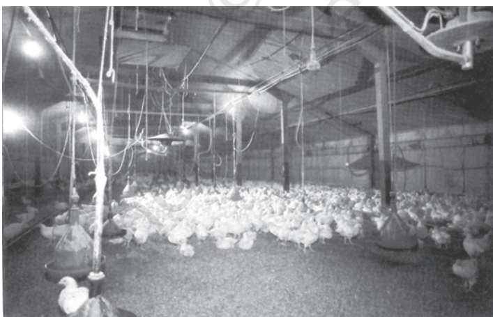
Fig. 6.4 Poultry has the largest share of total livestock in India

However problems related to over-fishing and