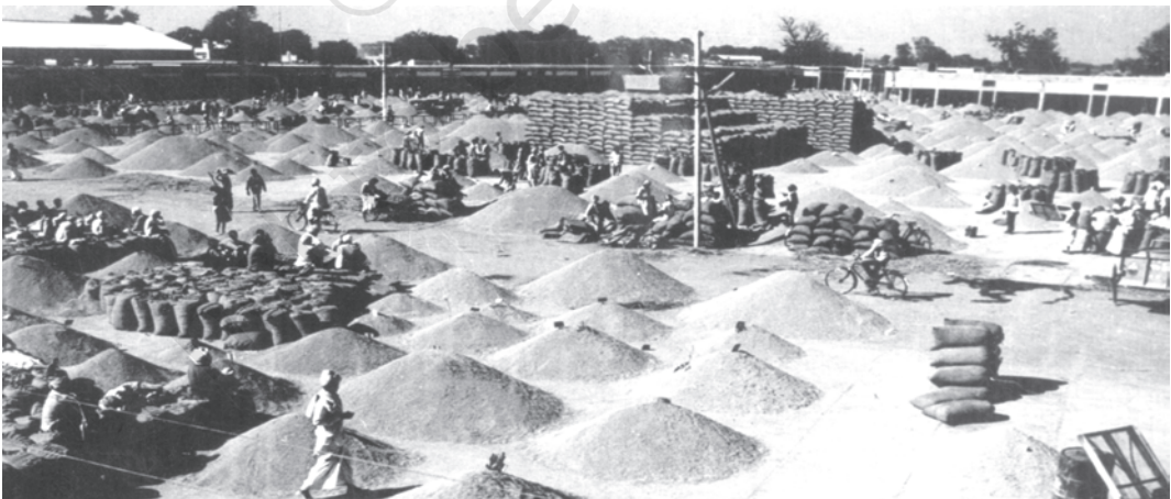
Fig. 6.1 Regulated market yards benefit farmers as well as consumers

Let us discuss four such measures that were initiated to improve the marketing aspect. The first step was regulation of markets to create orderly and transparent marketing conditions. By and large, this policy benefited farmers as well as consumers. However, there is still a need to develop about 27,000 rural periodic markets as regulated market places to realise the full potential of rural markets. Second component is provision of physical infrastructure facilities like roads, railways, warehouses, godowns, cold storages and processing units. The current infrastructure facilities are quite inadequate to meet the growing demand and need to be improved. Cooperative marketing, in realising fair prices for farmers' products, is the third aspect of government initiative. The success of milk cooperatives in transforming the