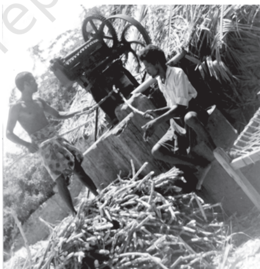
Fig. 6.2 Jaggery making is an allied activity of the farming sector

As agriculture is already overcrowded, a major proportion of the increasing labour force needs to find alternate employment opportunities in other non-farm sectors. Non-farm economy has several segments in it;