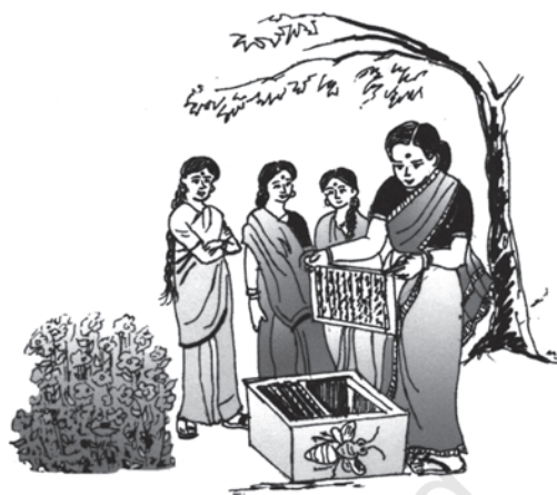
Fig. 6.5 Women in rural households take up bee-keeping as an entrepreneurial activity

Horticulture: Blessed with a varying climate and soil conditions, India has adopted growing of diverse horticultural crops such as fruits, vegetables, tuber crops, flowers, medicinal and aromatic plants, spices and plantation crops. These crops play a vital role in providing food and nutrition, besides addressing employment concerns. Horticulture sector contributes nearly one-third of the value of agriculture output and six per cent of Gross Domestic Product of India. India has emerged as a world leader in producing a variety of fruits like mangoes, bananas, coconuts, cashew nuts and a number of spices and is the second largest producer of fruits and vegetables. Economic condition of many farmers engaged in horticulture has improved and it has become a means of improving livelihood for many unprivileged classes. Flower