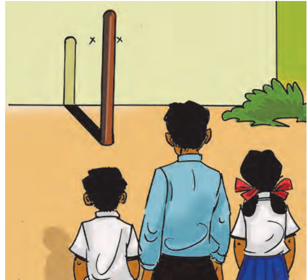
Figure 1.2 Experiment