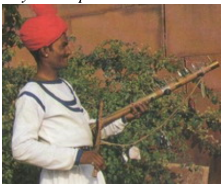
Nayak Bhopas / Rawanhatthas

1. It is the precursor to violin. It has 2 main strings, a number of support strings and is played with a bow. It has half a coconut shell and is made of bamboo.