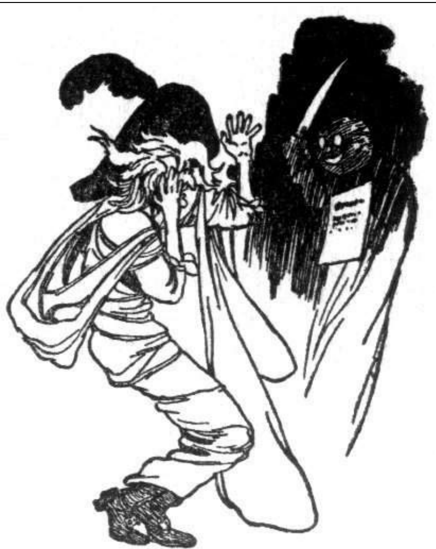
"ITS HEAD WAS BALD AND BURNISHED"

At half-past ten he heard the family going to bed. For some time he was disturbed by wild shrieks of laughter from the twins, who, with the light-hearted gaiety of schoolboys, were evidently amusing themselves before they retired to rest, but at a quarter-past eleven all was still, and, as midnight sounded, he sallied forth. The owl beat against the window-panes, the raven croaked from the old yew-tree, and the wind wandered moaning round the house like a lost soul; but the Otis family