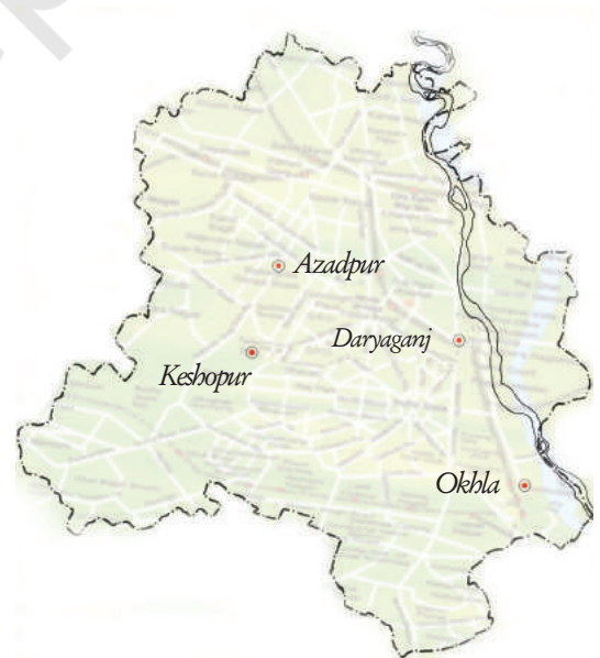
The above map of Delhi shows four of the 10 wholesale markets in the city.