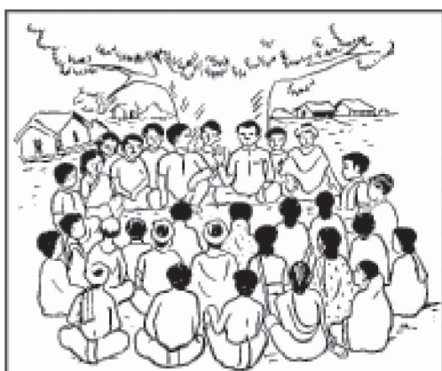
Villagers preparing a Disaster Management Plan

At the village level, the Village Disaster Management Committee headed by the Sarpanch/ Village Headman is responsible for preparing the Village Disaster Management Plans and also coordinating with various agencies for providing training to the Disaster Management Teams. The members should see to it that mock drills are carried out by the villagers at regular intervals by the villagers for various hazards.