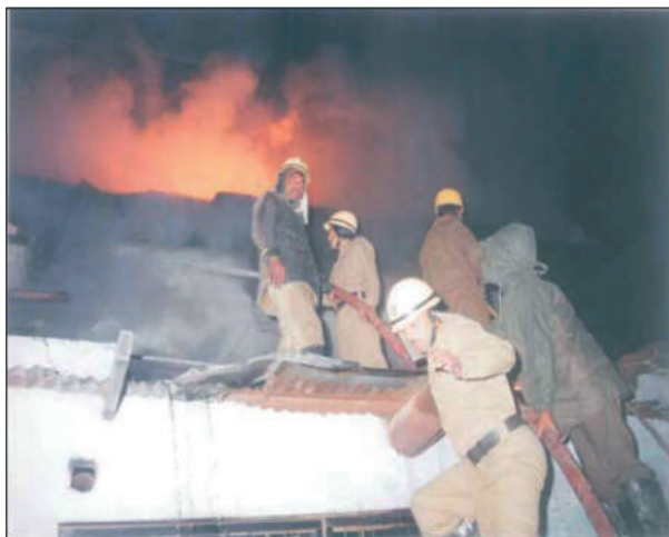
Delhi Fire Services trying to extinguish a major fire in a slum

At the time of disaster various agencies both government and non - government organizations play a crucial role in preparing the society. Home Guards, Civil Defence, Volunteers of National Service Scheme, Nehru Yuva Kendra Sangathan too play a major role at the time of crisis. This chapter tries to understand the functions and role of these agencies in disaster management, who make the society a better place to lives.