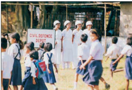
Civil Defence volunteers being trained

Civil Defence aims at saving life, minimizing damage to the property and maintaining continuity of industrial production in the event of a hostile attack. The two war emergencies faced by the country in 1962 and 1965 compelled the Government of India to reorient its emergency training activities from natural disasters to those concerning protection of life and property against enemy action. The National Civil Defence College