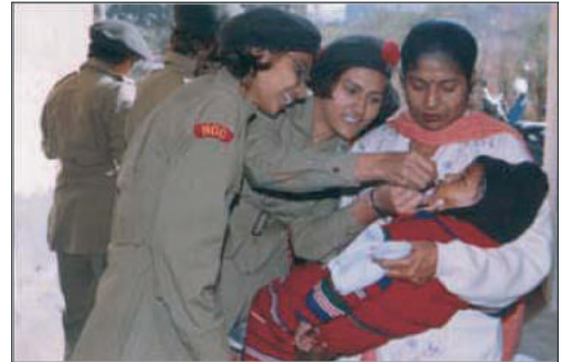
NCC Cadets helping the victims in the local hospital.