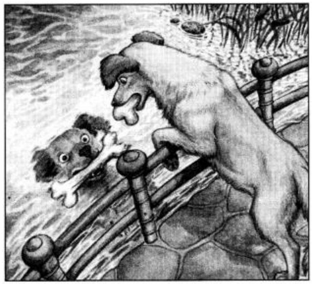
The Greedy Dog