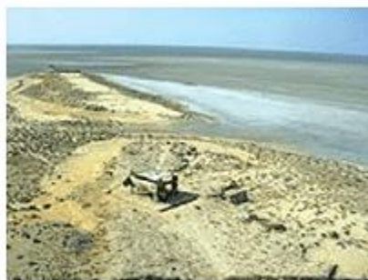
The Gulf of Kachchh

The Gulf of Kachchh and the Gulf of Khambat are on the western sides of the Gujarat Coast.