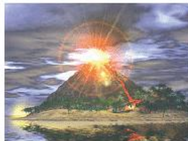
An active Volcano