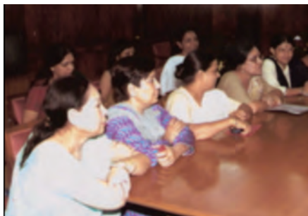
The above photo shows a few women Members of Parliament.

Why do you think there are so few women in Parliament? Discuss.