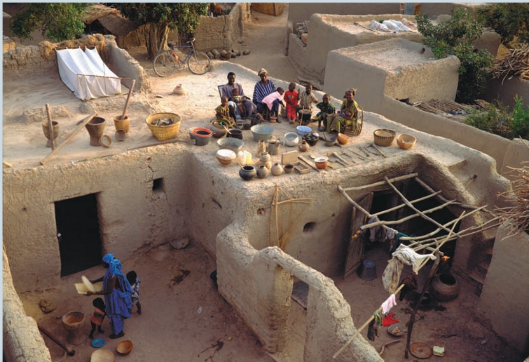
A Typical Family in Mexico