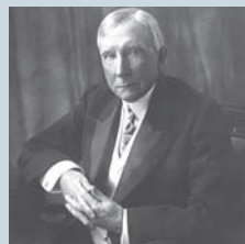
John D. Rockefeller

Despite his great wealth, Rockefeller did not enjoy many of the conveniences that we now take for granted. He couldn't watch television, play video games, surf the Internet, or send e-mail. During the heat of summer, he couldn't cool his home with air-conditioning. For much of his life, he couldn't travel by car or plane, and he couldn't use a telephone to call friends or family. If he became ill, he couldn't take advantage of many medicines, such as antibiotics, that doctors today routinely use to prolong and enhance life.