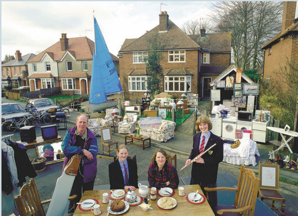
A Typical Family in the United Kingdom