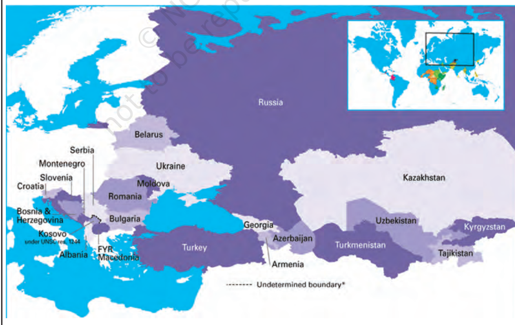
MAP OF CENTRAL, EASTERN EUROPE AND THE COMMONWEALTH OF INDEPENDENT STATES

Locate the Central Asian Republics on the map.