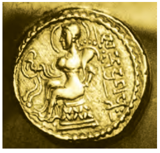
The king who played the veena. Some other qualities of Samudragupta are shown on coins such as this one, where he is shown playing the veena.

If you look at Map 7 (page 105), you will notice an area shaded in green. You will also find a series of red dots along the east coast. And you will find areas marked in purple and blue as well.